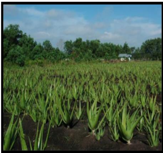
Figure 1. Pontianak Aloe vera

Kingdom : Plantae Phylum : Spermatophyta Class : Monocotyledonae Order : Liliales Family : Liliaceae Genus : Aloe Species : Aloe vera var. chinensis Baker